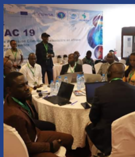
On the left, On-the-Job Trainees receiving their certificates with ACMAD experts; and on the right, Experts at PRESAC 19 pre-forum training on climate forecasting tools.