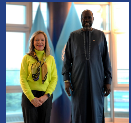
On the left, the ACMAD DG and the PAFO President after the signing of the MoU between the two institutions. On the right, the WMO SG with the ACMAD DG at WMO headquarters.