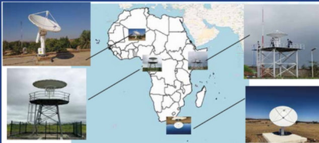
Regional Advanced Retransmission System (RARS) for low earth orbiting satellite data Network over Africa